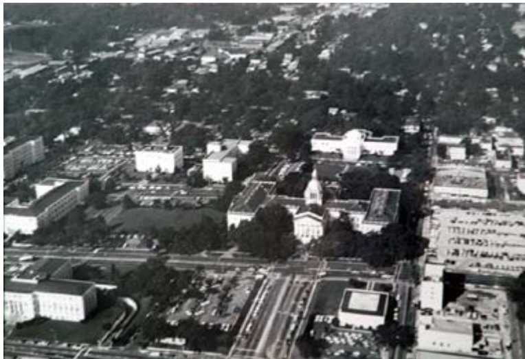
Aerial View of the Capitol 1966 – 1970 Florida Senate Archives (4 th Floor SOB – West) (1)