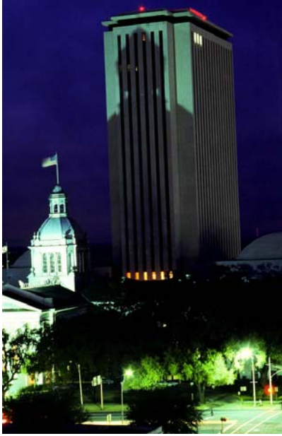
The Capitol at Night, 1984 Florida Senate Archives (4 th Floor SOB – West) (41)