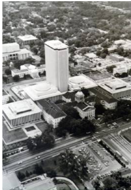
Aerial View Prior to the Restoration of the Historic Capitol, 1977 Florida State Archives (4 th Floor SOB – West) (38)