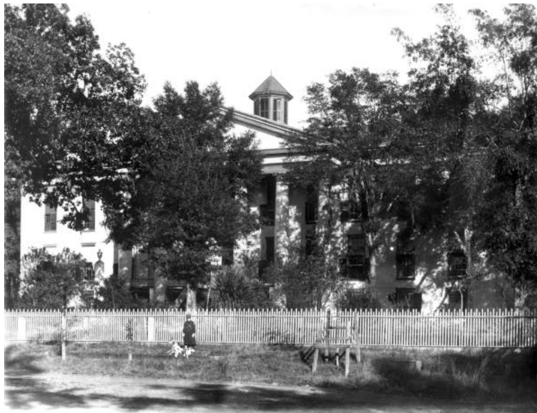
As the Capitol Appeared 1891 – 1902 When the Cupola Was Added and the Capitol Was Enlarged Florida State Archives (4 th Floor SOB – West) (17)