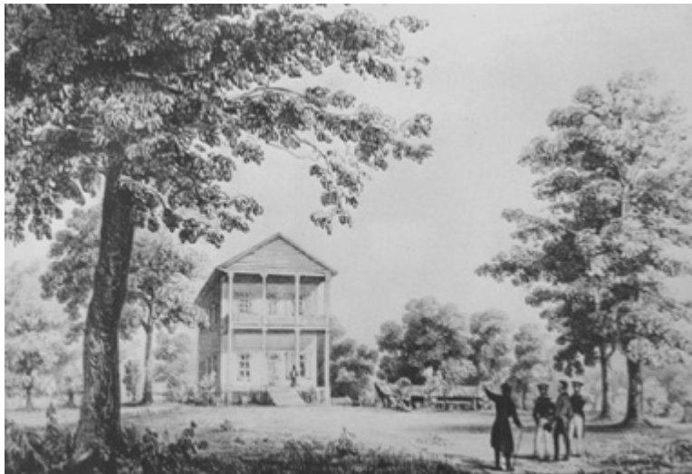
Florida's Capitol in 1826 (4 th Floor SOB – West) (34)