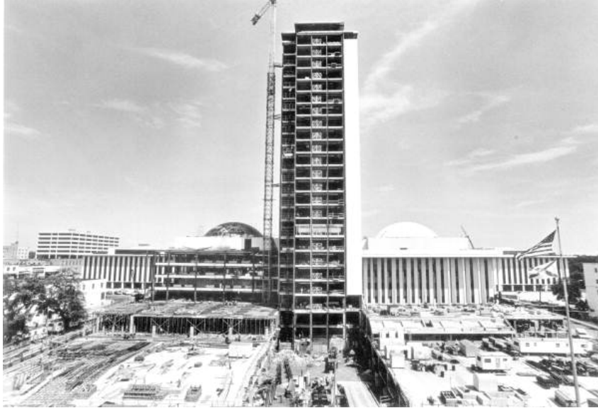
View of Construction of the New Capitol March 1976 Florida Senate Archives (4 th Floor SOB – West) (29)