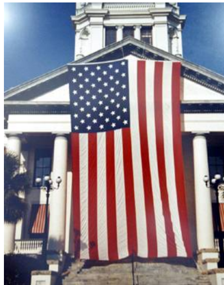
September 11, 2001 Florida Senate Archives (4 th Floor SOB – West) (16)