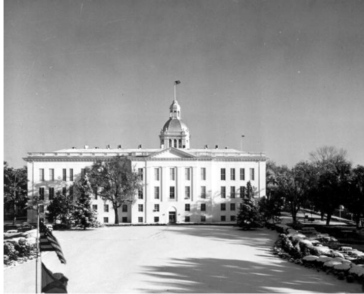
Snow on the Capitol, Looking North Toward the South Wing February 13, 1958 Florida Senate Archives (4 th Floor SOB – West) (42)