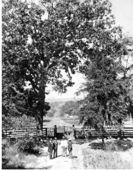
View From the Steps of the Historic Capitol, 1870s Florida State Archives (4 th Floor SOB – West) (26)