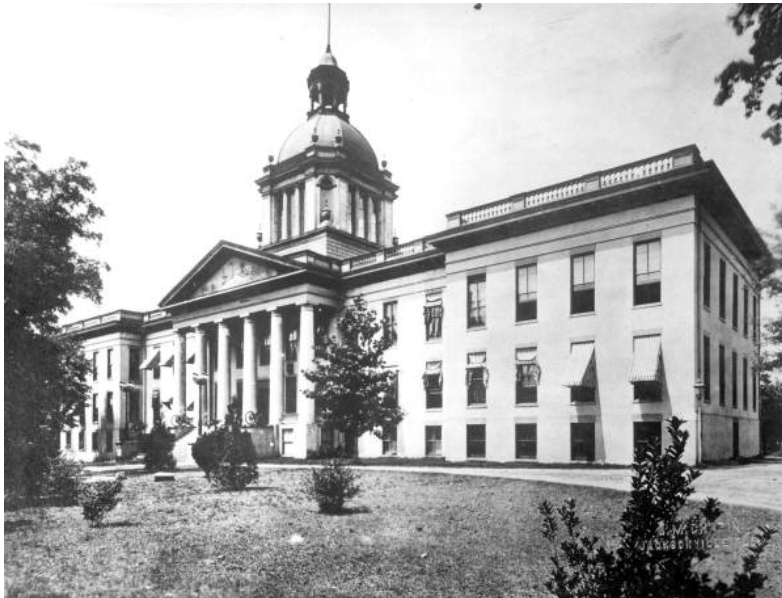
The Capitol as it Appeared After the Addition of the North and South Wings and the Dome 1901 – 1902 Florida State Archives (4 th Floor SOB – West) (23)