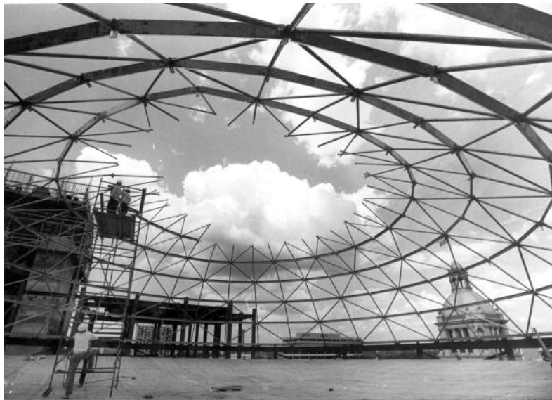
Steel Girders Being Erected for the Dome on the Senate Chamber of the New Capitol