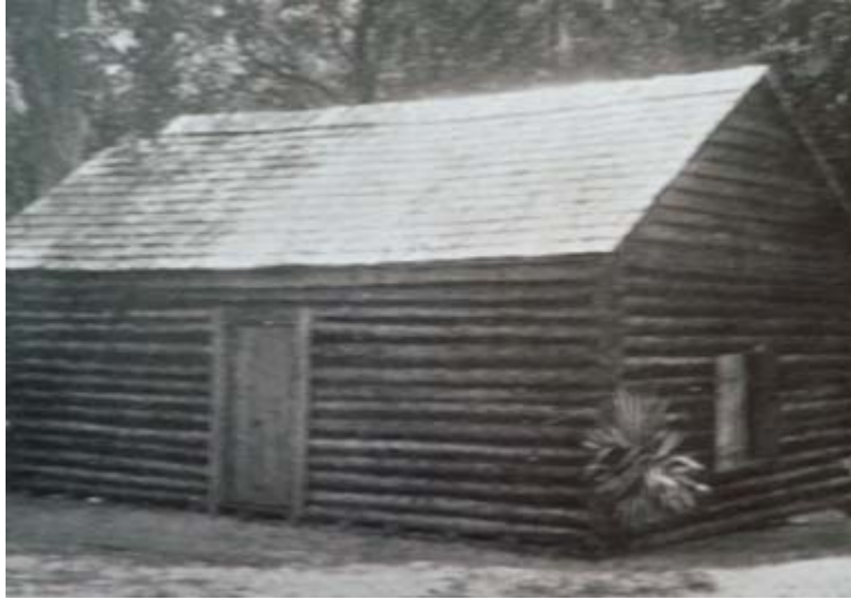
Replica of Florida's First Capitol, in Which the Third Session of the Territorial Council Was Convened in November 1824 Replica Was Built on the Capitol Grounds by Boy Scouts In Celebration of Florida's Centennial in 1924 Florida State Archives (4 th Floor SOB – West) (20)