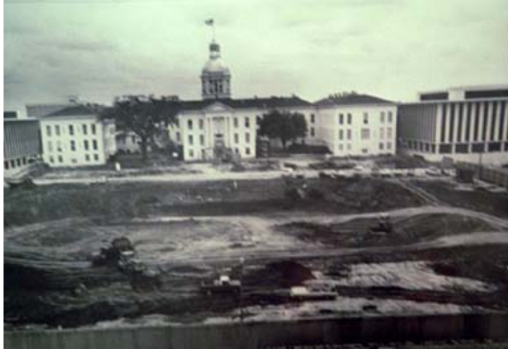
West Side of the Capitol, Showing Completed House and Senate Buildings and Future Site of the New Capitol